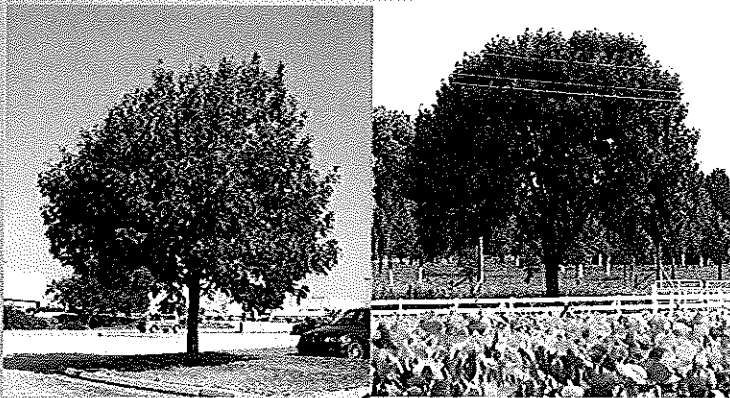
These ash trees are healthy, have all of their leaves, and provide shade and beauty to the landscape. They would be good treatment candidates.