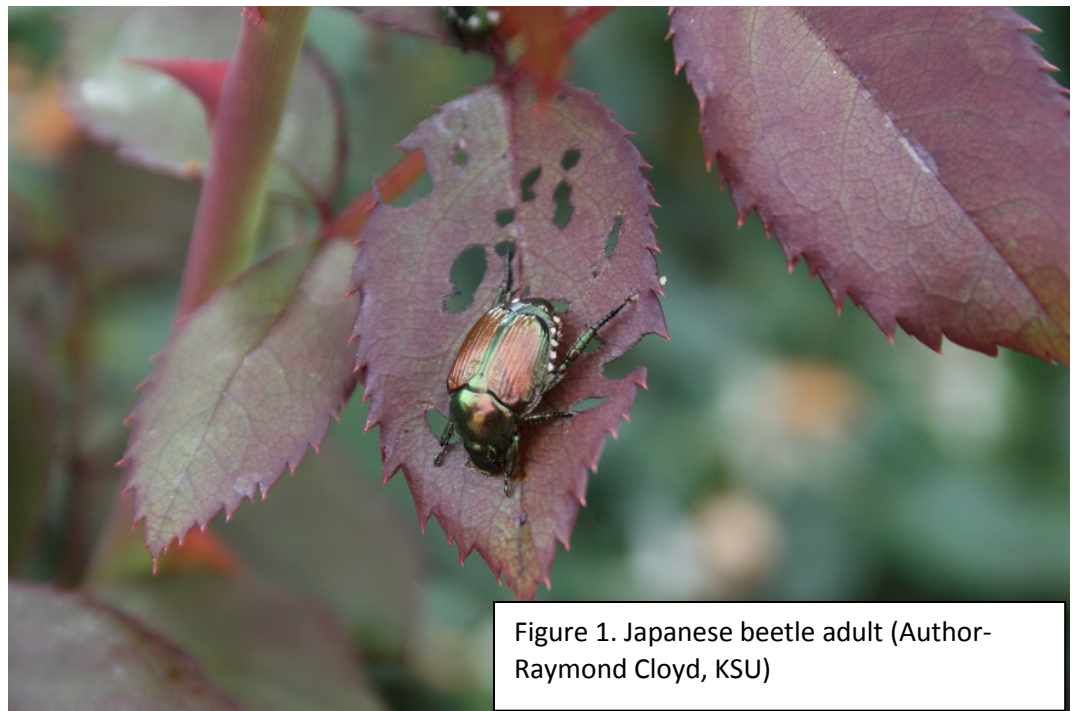
Figure 1. Japanese beetle adult (Author-Raymond Cloyd, KSU)

Japanese beetle, Popillia japonica is native to Japan and was first reported in the United States in 1916 in the state of New Jersey. Currently, Japanese beetles are established