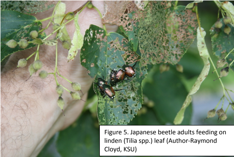
Figure 5. Japanese beetle adults feeding on linden ( Tilia spp.) leaf (Author-Raymond Cloyd, KSU)