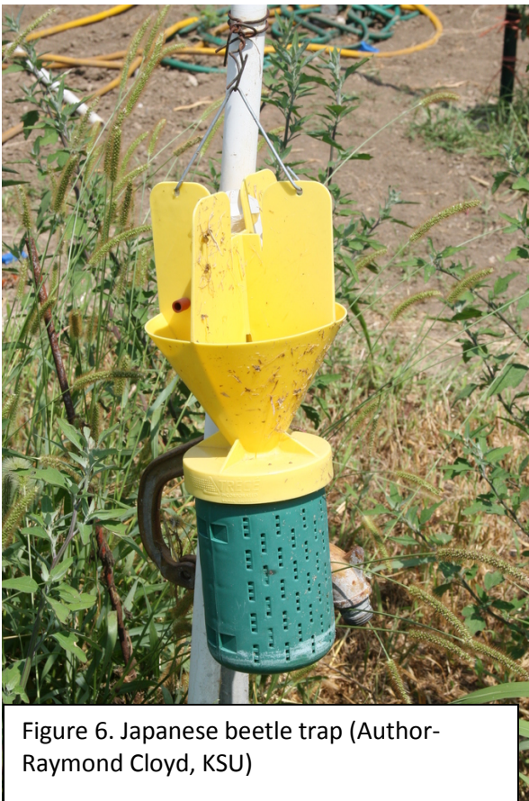
Figure 6. Japanese beetle trap

possibly decrease susceptibility. In addition, removing weeds such as smartweed ( Polygonum spp.) that are attractive to Japanese beetle adults may alleviate infestations. Physical involves hand-picking or collecting Japanese beetle adults from roses before populations are extensive. The best time to hand-pick or collect adults is in