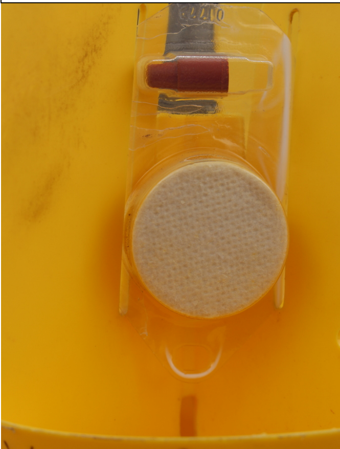
Figure 7. Floral lure (on left) and sex pheromone (on right) associated with Japanese beetle trap (Author-Raymond Cloyd, KSU)

especially when populations are excessive. In addition, thorough coverage of all plant parts will increase effectiveness of the application. The insecticide carbaryl (Sevin®) and several pyrethroid-based insecticides including those containing bifenthrin or cyfluthrin as the active ingredient can be used to suppress Japanese beetle adult populations. However, most of these insecticides also directly harm many natural enemies (parasitoids and predators) so their continual use may lead to secondary pest outbreaks of other pests including the twospotted spider mite ( Tetranychus urticae ). Furthermore, these insecticides are directly harmful to honey bees and bumble bees. Therefore, applications should be conducted in the early morning or late evening when bees are less active. In general, systemic insecticides, are not effective because Japanese beetle adults have to feed on leaves and consume lethal concentrations of the active ingredient.