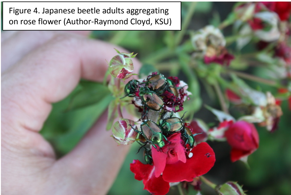
Figure 4. Japanese beetle adults aggregating on rose flower (Author-Raymond Cloyd, KSU)

preventing flowers from opening or causing petals to fall prematurely. Furthermore, adults will consume entire rose petals, and feed on the pollen of fully-opened flowers.